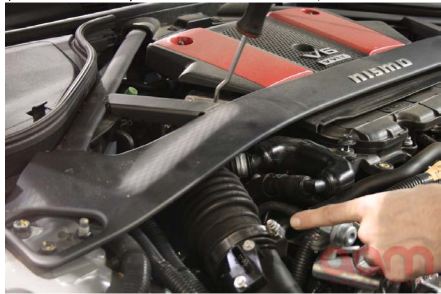
5) Remove 10mm bolt securing airbox

3) Loosen worm clamps at throttle bottle and air box, remove intake boot