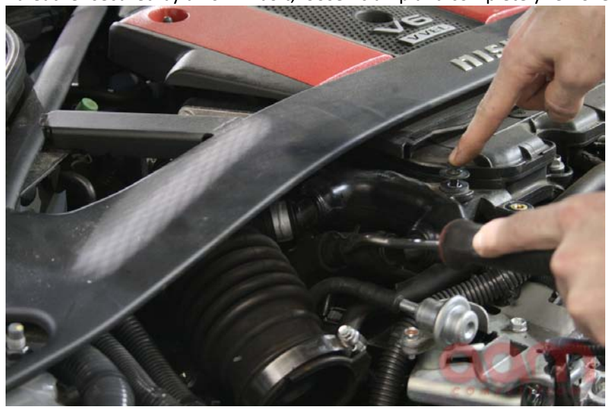
7) Repeat on Passenger side