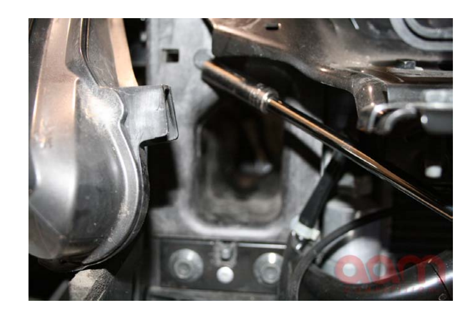
17) Using an air saw, router, grinder, dremel or any cutting tool. Open up intake air duct to fit new intake Before: